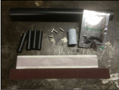
Contents of submersible pump cable splice kit.